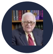
Eugene Braunwald, MD

CVI's goal is to offer all healthcare providers convenient access to the latest and most relevant clinical information on the diagnosis, therapeutic options, and treatment of cardiovascular disease. CVI also focuses on the prevention of cardiovascular disease. CVI programs are known for their outstanding educational content and feature internationally recognized thought leaders in the fields of cardiovascular medicine and related subspecialties. CVI has welcomed luminaries including: