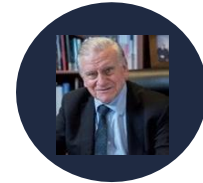
Valentine Fuster, MD